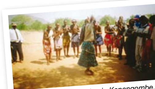
Open community meeting in Kapangombe, Namibe province