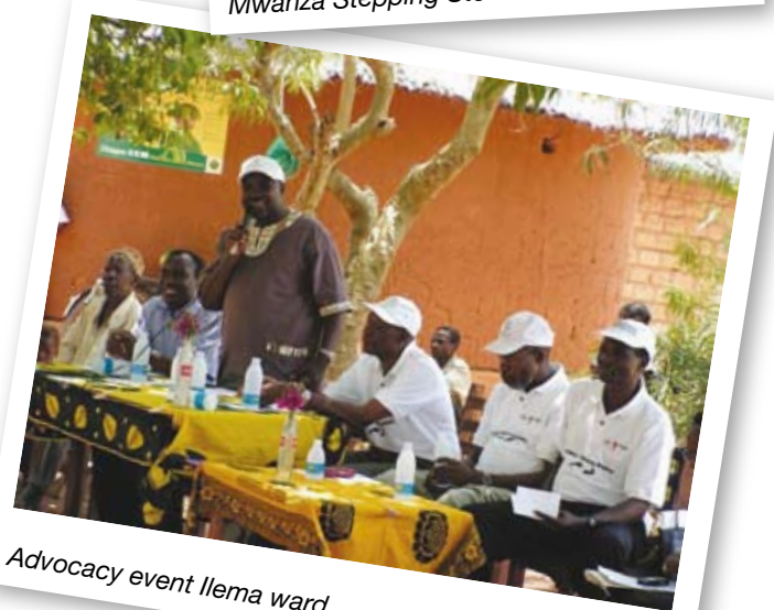
Advocacy event Ilema ward