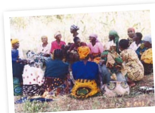
Mwanza Stepping Stones session

The establishment of an Advisory Committee bringing together project partners, service providers, policy makers and community representatives encouraged strong collaboration between SS project and partners in complementing social services and has led to some concrete improvements in the services provided. However, while poverty persists, HIV/AIDS vulnerability will remain acute.