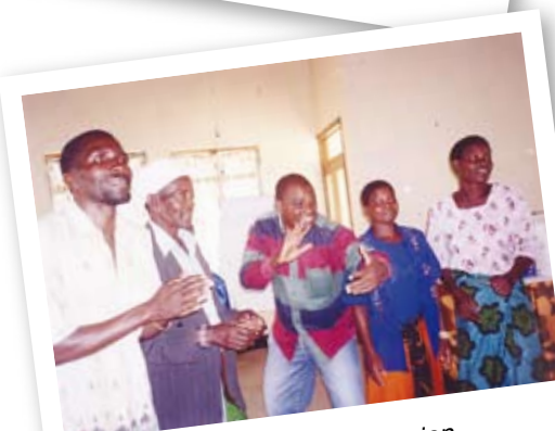
Mwanza Stepping Stones session