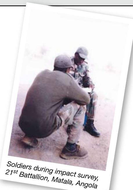
Soldiers during impact survey, 21st Battalion, Matala, Angola