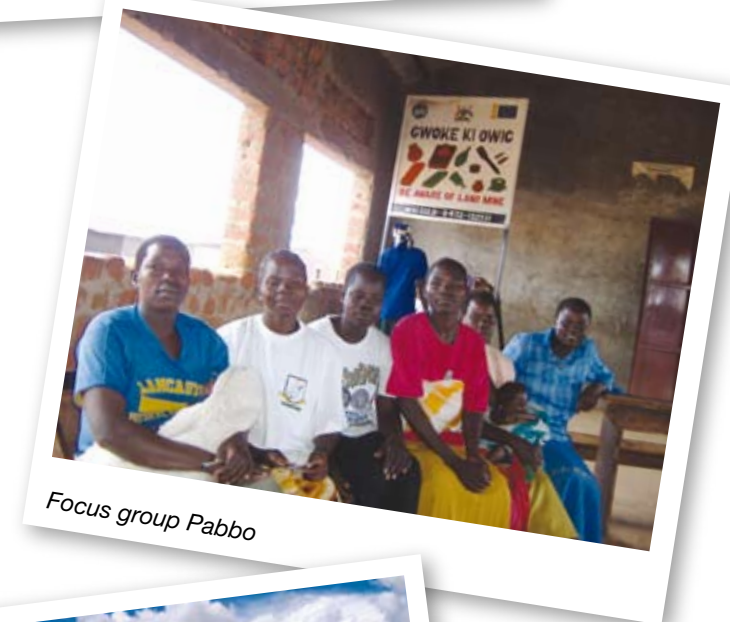
Focus group Pabbo