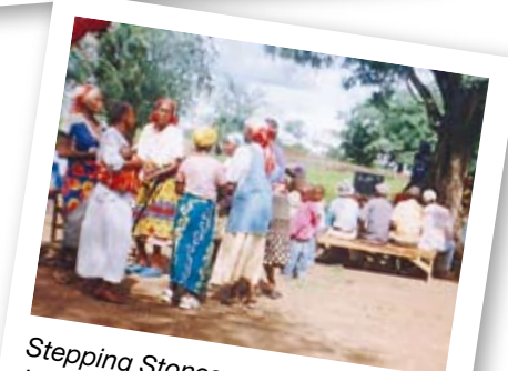
Stepping Stones session in Kanjanguite, Angola