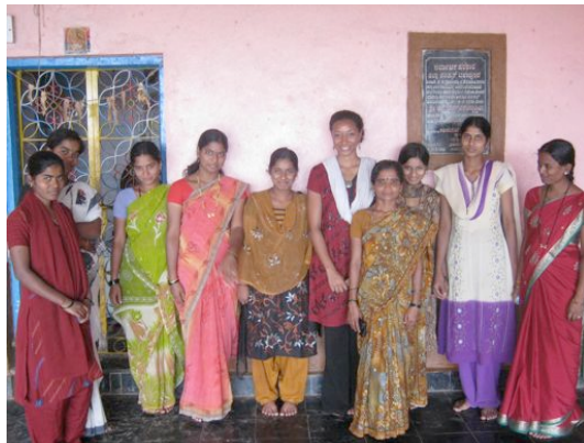
group of women