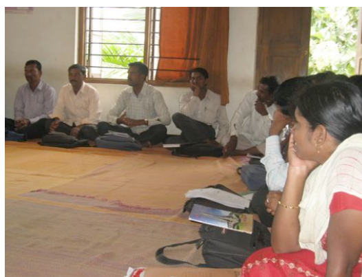
Stepping Stones facilitators, link workers and coordinators