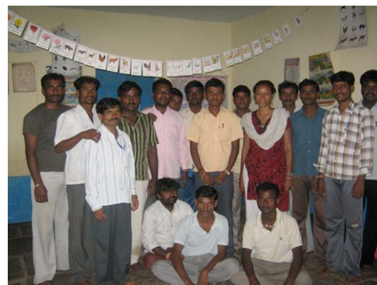
group of men

In this village, the impact of Stepping Stones was reported as being: