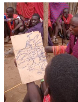
A younger group of Maasai men doing the Stepping Stones “Body Mapping” exercise.

Narok. The experience was wonderful. I do not speak Maasai so I needed to train a team of experienced trainers who have basic skills of adult learning background mainly consisting of community health workers and youth peer educators. After going with them through a three-day experimental program, we went to the field to conduct the same with the four peer groups, where each person was addressing a peer group of the same gender and age set. The outcome was wonderful.