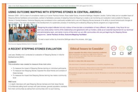
The most recent Stepping Stones newsletter: on M&E

Email Distribution Service: Previously, personal email accounts were being used to send Stepping Stones newsletter to hundreds of people. This resulted in severe problems with spam and a lot of unwanted messages into a personal use mailbox. In order to combat this problem, we implemented Mailchimp. This is used to design and send regular emails. It removes the issue of spam and has allowed us to “clean” our contact database by highlighting bouncing contacts. Furthermore, it keeps data about how many people open our newsletter and how many people click on hyperlinks within the emails.