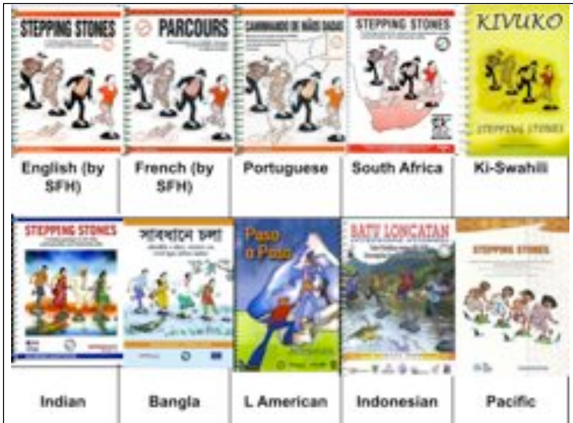
A few of the many Stepping Stones adaptations in use around the world