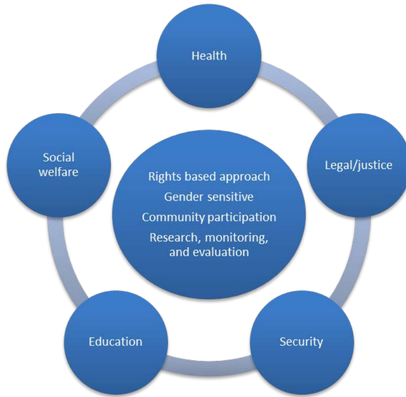
Figure I. Comprehensive, multi-sectoral response to GBV

for example, training HTC and adherence counselors to offer GBV screening, counseling, and referrals.